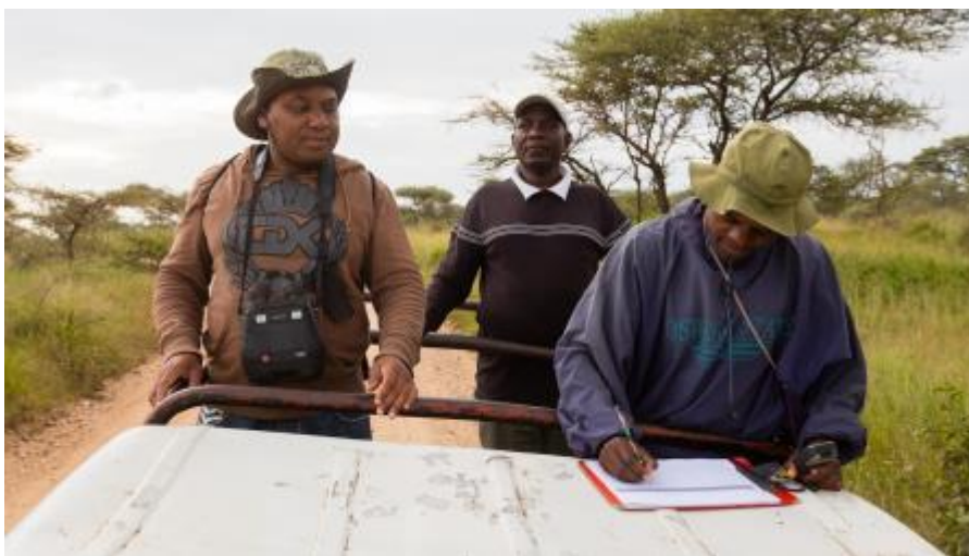
Project teams carrying out road transect surveys. They drive through long road sections and record all the large animals they can see from the car and determine their distance from the road.