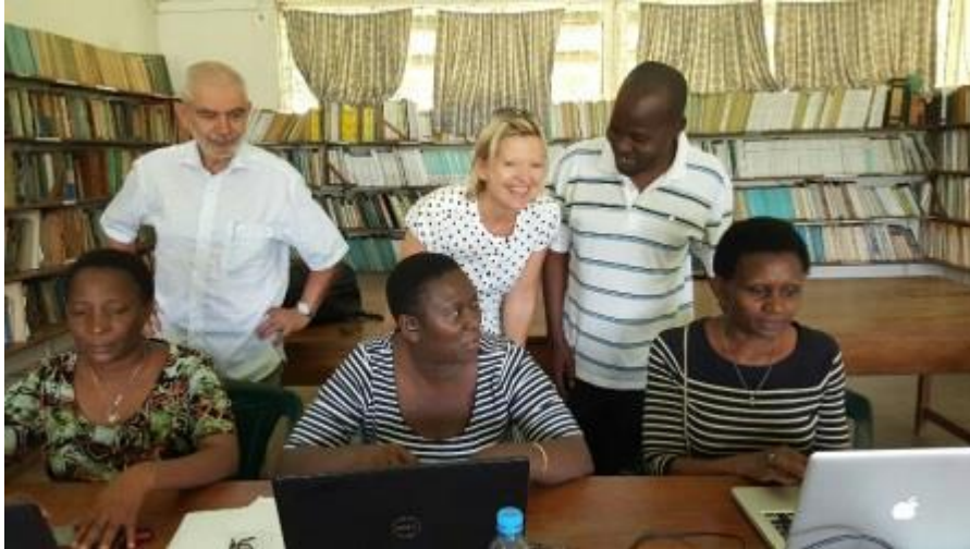
Database group developing the data management plan in Serengeti, Tanzania, February 2016.

Collection of socio-economic data: Existing socio-economic data from various institutions have been collected, compiled and uploaded in the project repository. Data on human and livestock demography for specific study villages have not yet been collected as we are awaiting confirmation of the targeted study villages.