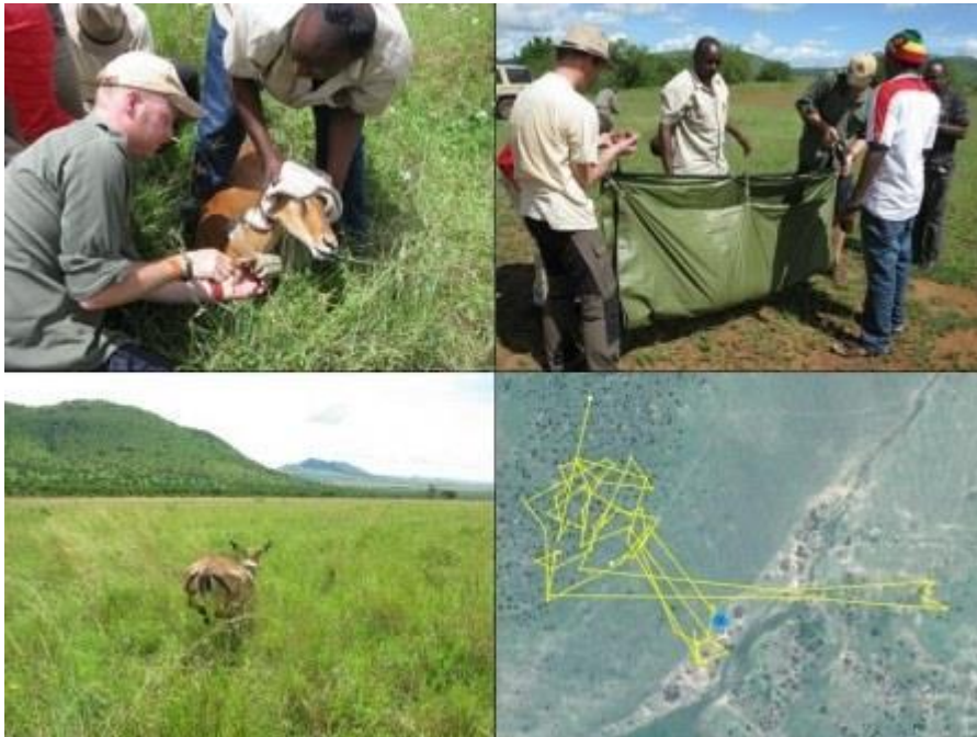
Immobilizing, weighing, and fitting impala with satellite GPS collars in Serengeti National Park.

Insights gleaned from the movement and activity data will be further complemented by data collected during regular fieldwork. Here, detailed observations will assess how herds' behaviour, particularly in response to the presence of humans, may differ depending on the presence or absence of threatening processes, such as areas where they are exposed to high levels of bushmeat poaching or well protected within the national park. Faecal samples will be collected during this fieldwork, facilitating the subsequent extraction and analysis of stress hormone levels. The comprehensive study, therefore, aims to generate a greater understanding of how diverse human activities and land use types may affect a model ungulate species.