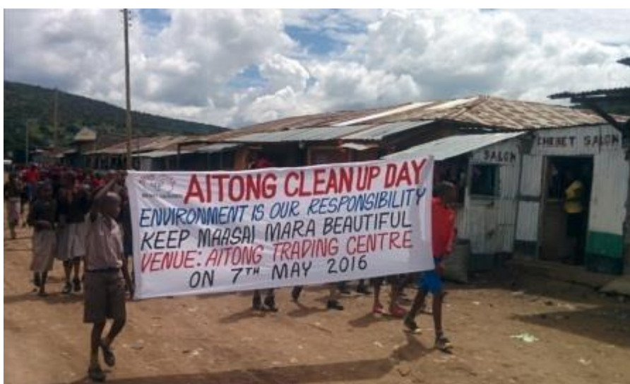
Pupils from Aitong Primary School in the Mara Narok area lead a march to support a clean-up exercise in the community.

Through the meetings, we have also been able to identify schools as an additional channel for communicating our research findings. When the team visited Narok, pupils from the local primary school had a campaign to support a clean-up exercise within the community. This may be a useful way to communicate with the local community so the project plans to partner with such schools as part of communication activities and awareness creation at the community level.