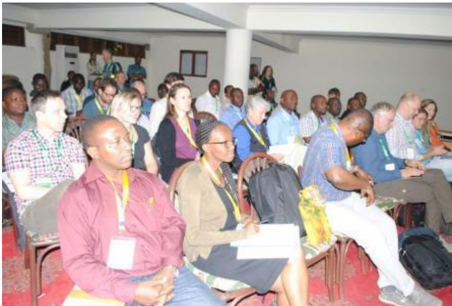
Participants at the side meeting during the 10th TAWIRI scientific conference held at Naura Spring Hotel, Arusha in December 2015.

Face-to-face interactions during meetings are yet another important form of communication. During the 10th TAWIRI scientific conference held on 1–4 December 2015, the project organized a side meeting which was open to non-project scientists as well. The meeting provided a good opportunity for the WP leaders to present their proposed research methods as well as outputs of activities they had implemented that were relevant to the proposals made. The meeting was crowned with a general discussion session for participants to provide feedback and seek further clarification.